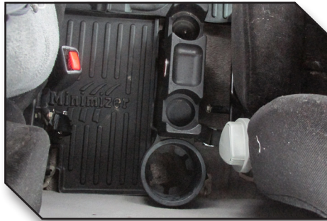
Figure 3 - Factory Thermos

6. For cases where a fire extinguisher is mounted behind the driver seat, the left rear corner of the center mat shaded in yellow may be trimmed to allow for clearance.