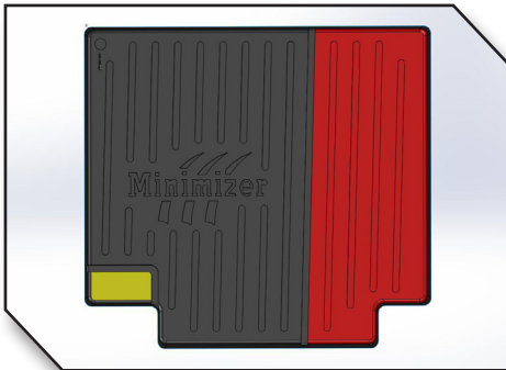
Figure 4 - Trimming Diagram

7. Next install the mat for the passenger side of the vehicle as shown in Figure 5.