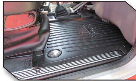
Figure 5 - Passenger Mat Fit

8. Install the retention hook to secure the driver side floor mat from any movement. Follow installation steps a, b, and c below.