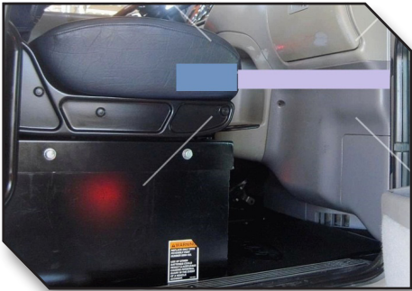
Figure 2 - Passenger Seat with Battery Storage