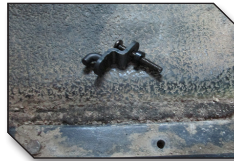
Figure 7 - Hook and Spacer Assembly

c) Insert the hook assembly through the transmission cover and tighten using a #3 Phillips screwdriver. Orient the floor mat hook