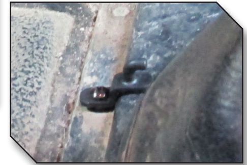
Figure 8 - Proper Hook Orientation

9. Install the driver side floor mat and engage it into the retention hook. The driver mat must be pushed all the way forward so the front lip makes full contact with the lower dashboard kick panels. Nest the left rear edge of the passenger mat over the top of the right rear edge of the driver mat.