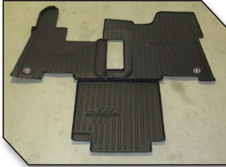
Figure 1 - KIT FKPB4B Contents