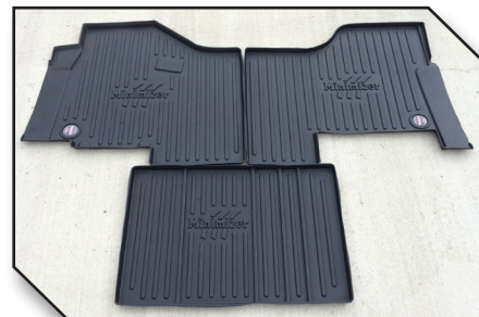
Figure 2 - KIT FKPCR1AB Contents