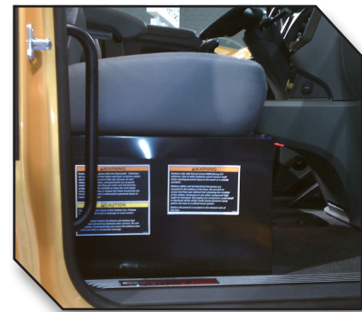
Figure 3 - Passenger Seat with Battery Storage