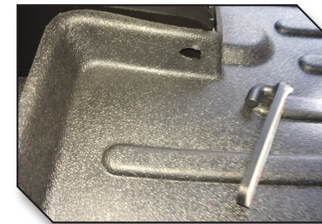
Figure 9 - Driver Mat with Hook Opening