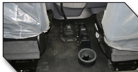
Figure 4 - Thermos Holder