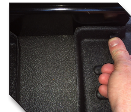
Figure 10 - Apply Pressure to Hook

8. FAILURE TO PROPERLY INSTALL THE RETENTION HOOK FOR THE DRIVER SIDE FLOOR MAT MAY ALLOW THE MAT TO SHIFT, WHICH MAY INTERFERE WITH PROPER FUNCTIONING OF THE VEHICLE'S PEDALS, POTENTIALLY RESULTING IN LOSS OF CONTROL OF THE VEHICLE AND SERIOUS INJURY OR DEATH.