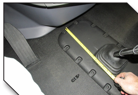
Figure 6 - Hook and Spacer Assembly