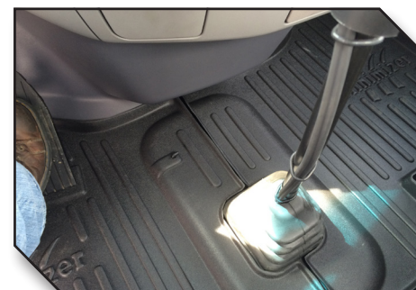
Figure 8 - Kit FKPCR1MB Driver Mat with Retention Hook