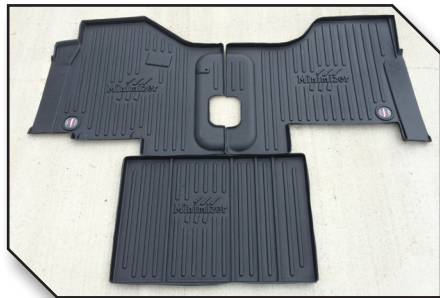
Figure 1 - KIT FKPCR1MB Contents