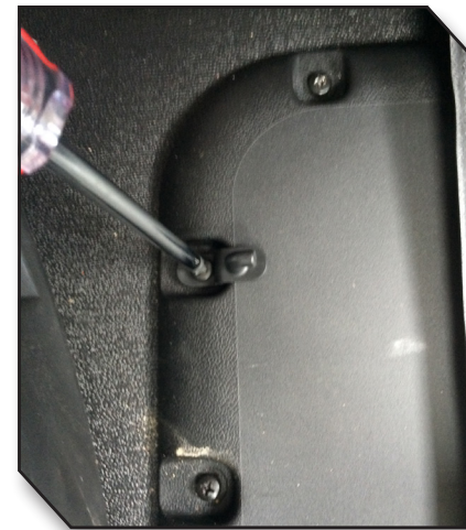
Figure 7 - Retention Hook Installation